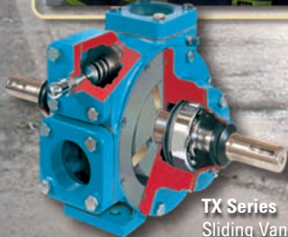
TX Series Sliding Vane Pump

"The cold, hard fact is, on the ice road, nothing beats a Blackmer pump!"