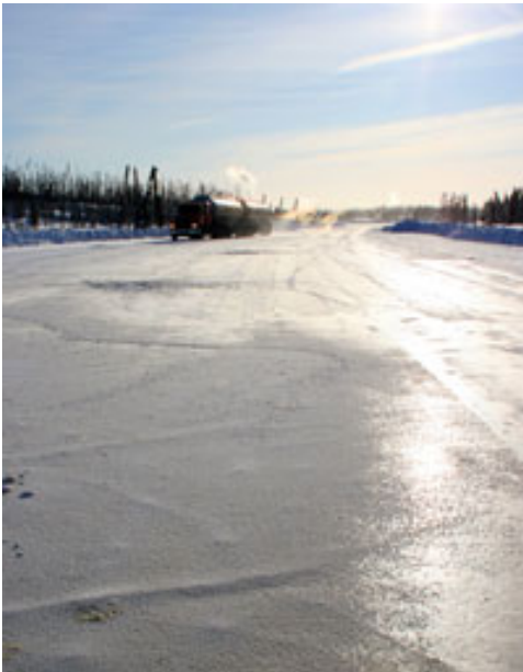
An ARS transport on the Ice Road delivers diesel fuel to the Diavik Diamond Mine.

When a fleet of fuel-delivery trucks is repeatedly traversing more than 350 kilometers of 40-inch thick Contwoyto ice road near the Arctic Circle in northern Canada, there are bound to be some emergencies. And when those emergencies arise, operators and drivers rely on the Rule of Three: